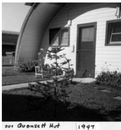
our Quonset Hut 1947